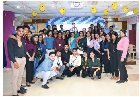
Frostbite Management Game by HR Club