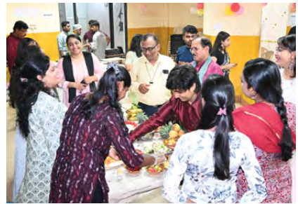
Flavour Fiesta (Food Mela 2024) organised at IMIS, Bhubaneswar