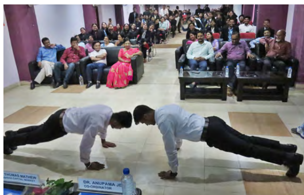
Seminar on Corporate Wellness