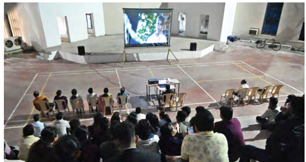
IMIS Screen Club presents Movie Night