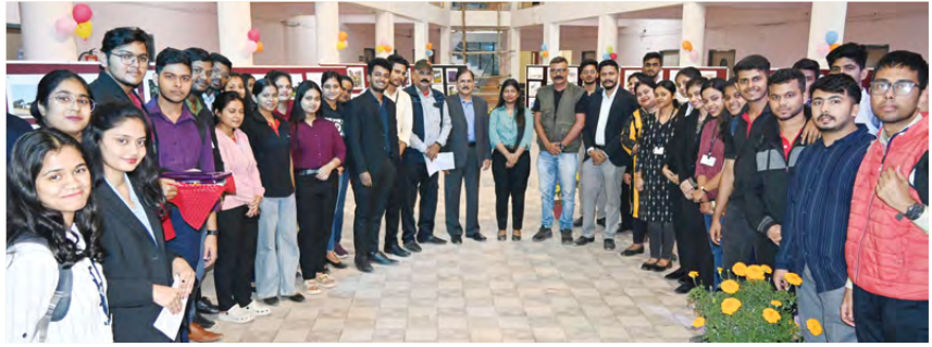
Photography Exhibition & Competition