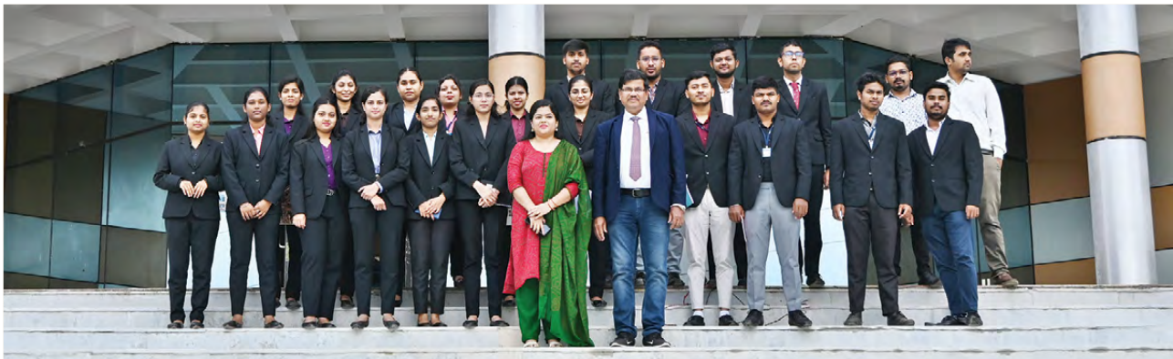
Seminar on “Empowering Managerial Precision : Unveiling Insights Thought Financial Statement Analysis”