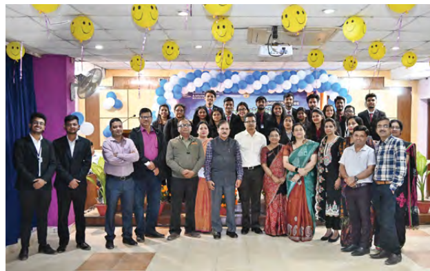
An Extempore Speech Competition was conducted on 26th Nov' 2024 at IMIS, Bhubaneswar to commemorate the adoption of the Constitution of India.