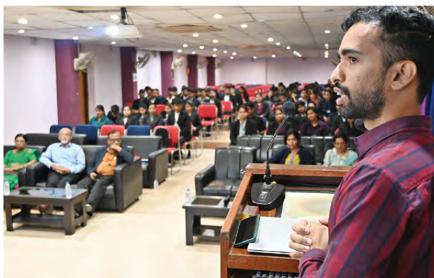
Seminar on "Optimizing Usage of Excel"