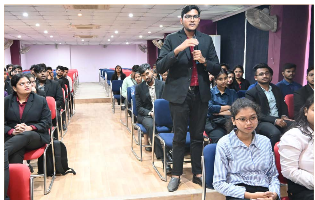
IMIS Bhubaneswar conducted the SadiMax (Sales and Marketing Seminar).