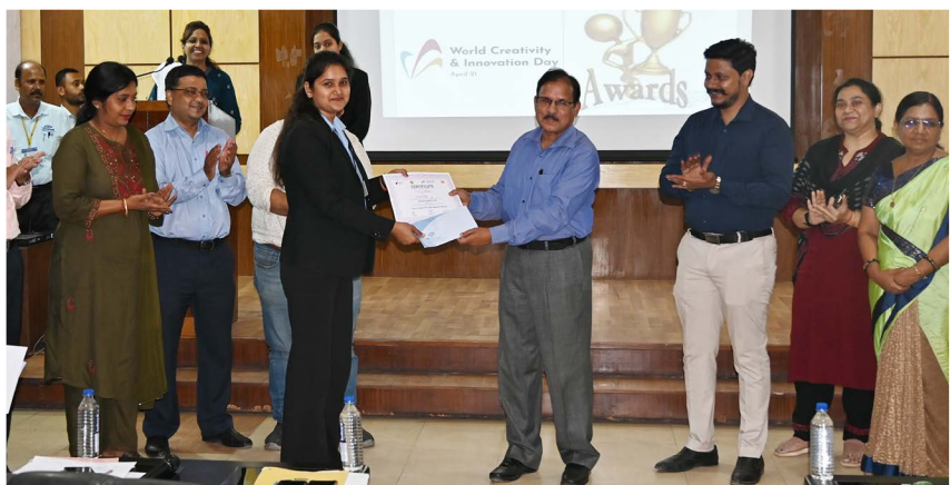
IMIS Bhubaneswar organized a speech competition on the occasion of World Creativity and Innovation Day.