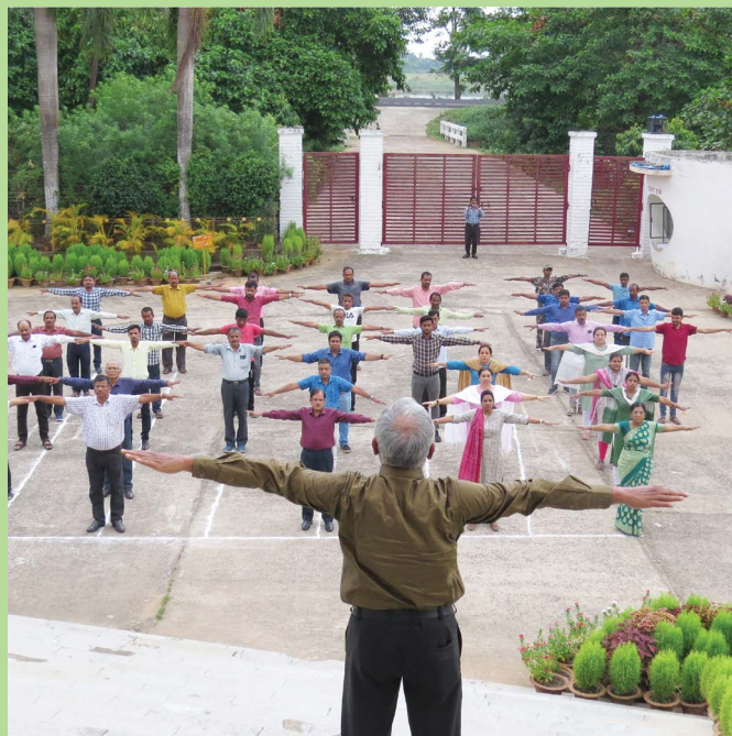
IMIS celebrates International Yoga Day