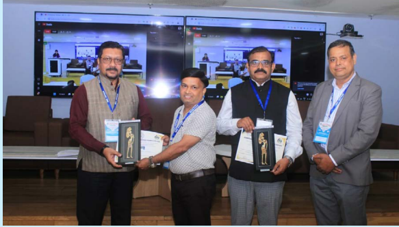
Chaired the marketing session at IMIT, Cuttack on the International conference on sustainable Businesses-People, Planet, Profit