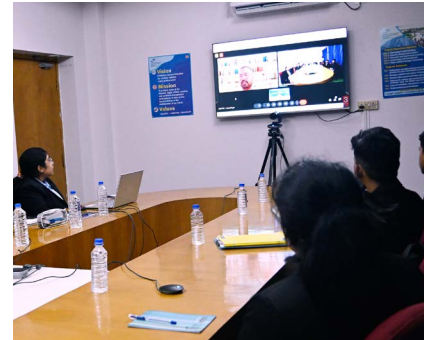
IMIS Bhubaneswar conducted an HR seminar.