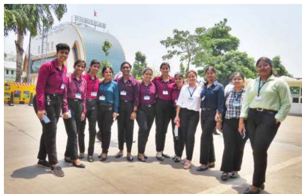
Industrial visit to Oriclean Private Limited, Tangi, Cuttack