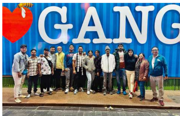
Study Tour 2024 to Gangtok and Darjeeling for PGDM Batch 2023-25 students