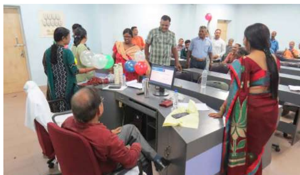
Capacity Building Training Programme held at IMIS for the non-teaching staff