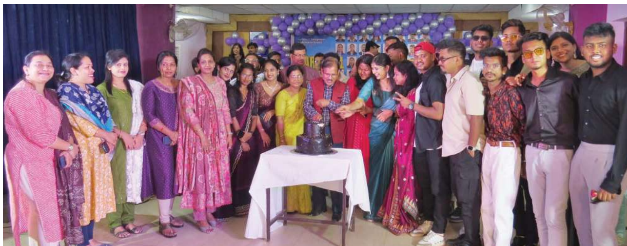
Farewell for the PGDM Batch 2022-24