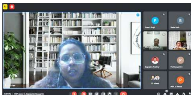
Faculty Development Programme on Application of Artificial Intelligence (AI) in Academic Research