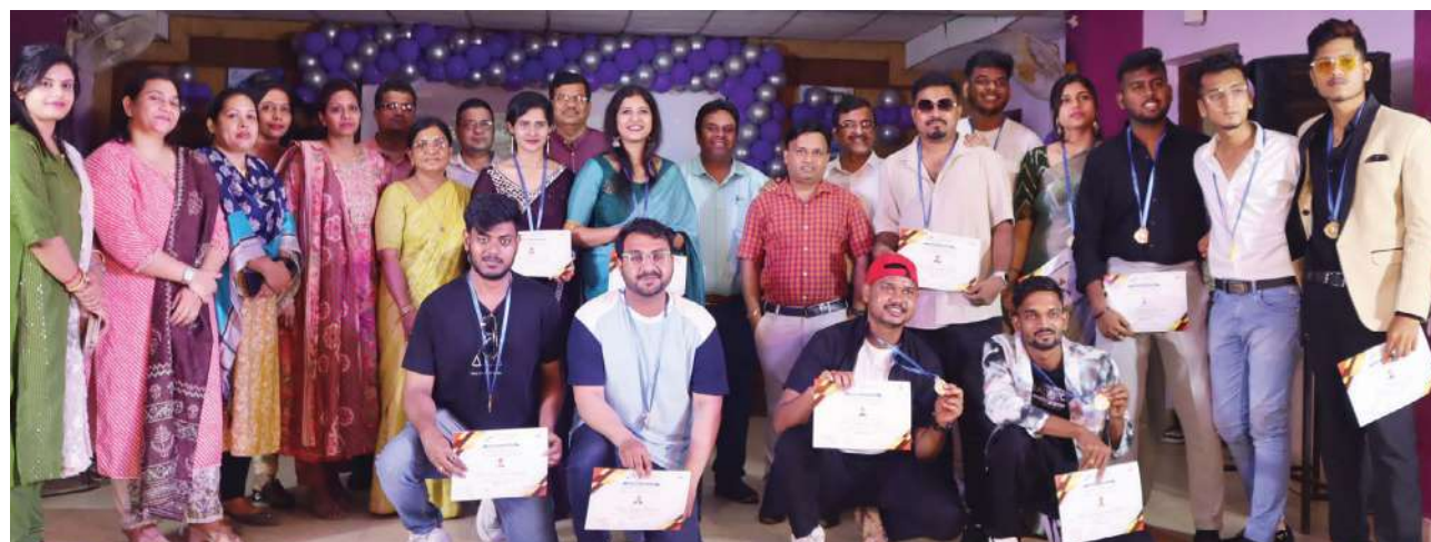
Certificates and prizes were distributed to the students for various management activities and games held during academic year 2023-24