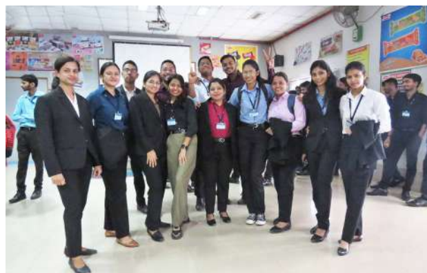
Industrial visit to Parle (Lingaraj Biscuits Private Limited), Chandaka Industrial Estate