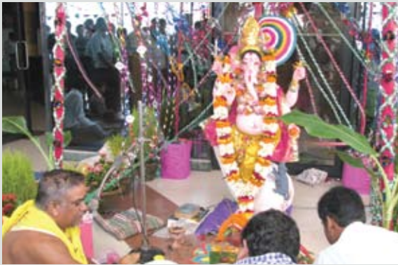
Ganesh Puja celebration