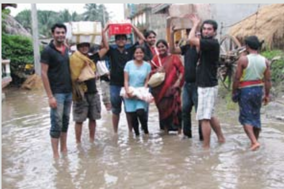
Flood relief in Gop Block