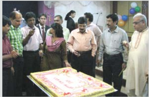
Teachers' day celebration