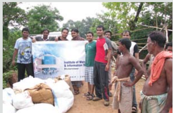
Flood relief in Delanga Block