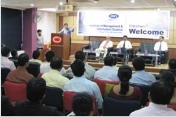
Welcome function for freshers