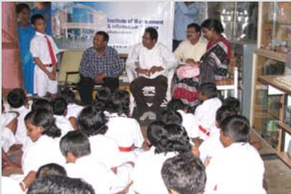
Memories of Jeevan Jyoti Ashram