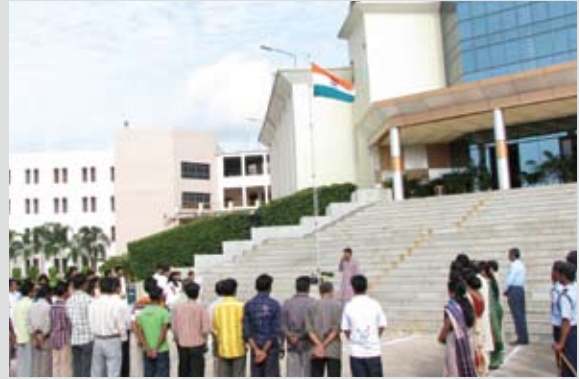
Independence day observation