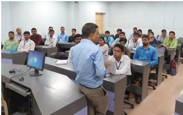
Celebration of 3rd Anniversary of National Education Policy 2020