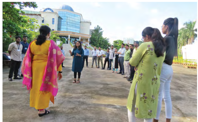
Read Me - (Non Verbal Communication)