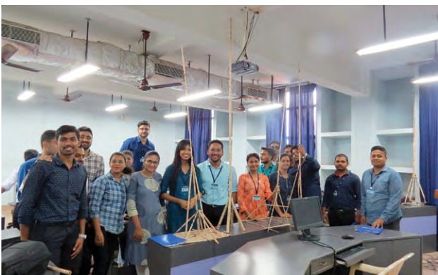
Tower Building Coordination Skill