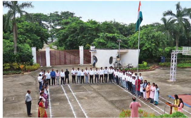
Independence Day Celebration in our College