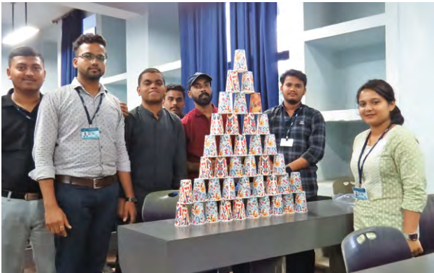
Building Leadership Skill Activity