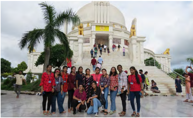
Out Bound Programme to Dhauli Santi Stupa