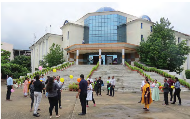
Baloon Bursting - Team Building Activity