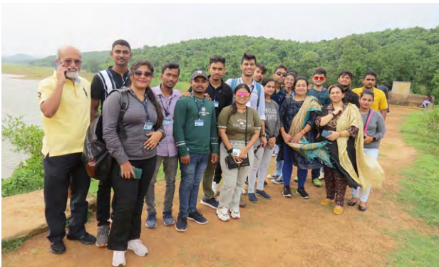
Out Bound Programme to Deras