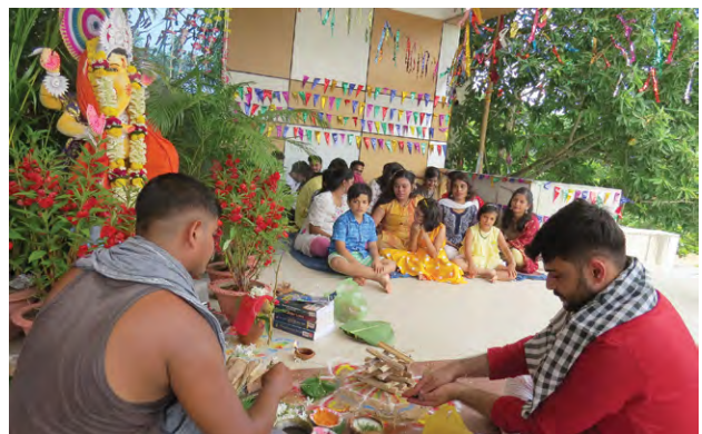
Ganesh Puja Celebration