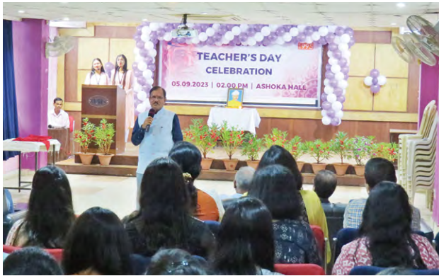
Teacher's Day Celebration at IMIS, Bhubaneswar