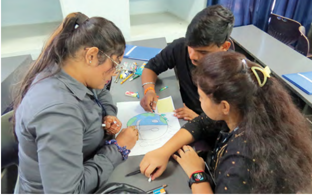
Poster Making Competition