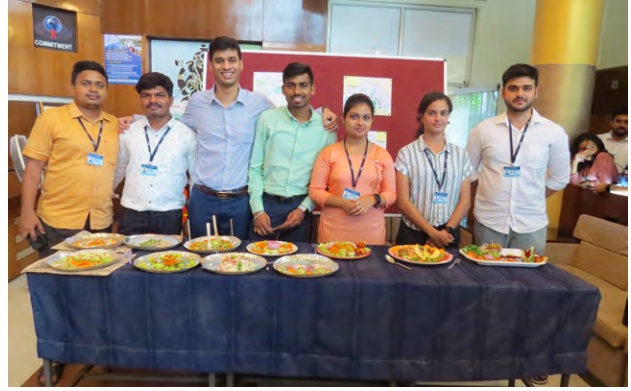
Salad Making Competition